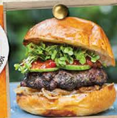
The Buccaneer Burger