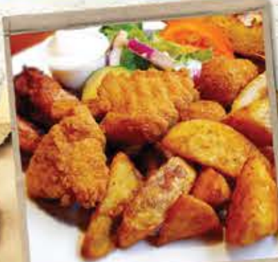
Jacks Combo Platter

CHICKEN WINGS £6.45 Marinated Chicken Wings served with a BBQ sauce