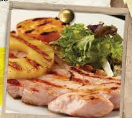
Gammon & Pineapple

Our sirloin steak is rich in flavour, grilled by our expert chef to your specification and served with chips, peas and half a grilled tomato