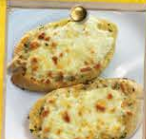
3 Slices Garlic Bread

Chips £3.50 Mixed Salad £3.50 Peppercorn Sauce £2.95