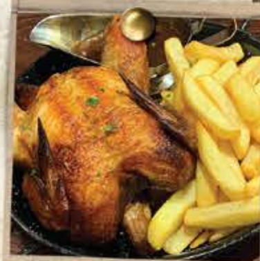
Whole Spit Roasted Chicken

A succulent whole chicken cooked on the Spit roast served with chips and gravy. Swap your gravy for Spicy Piri Piri sauce for £1